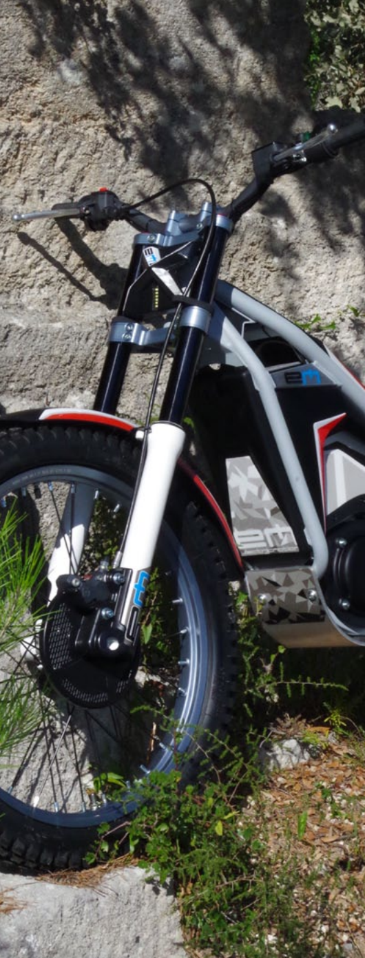
TECH Aluminium Fork Optimized settings