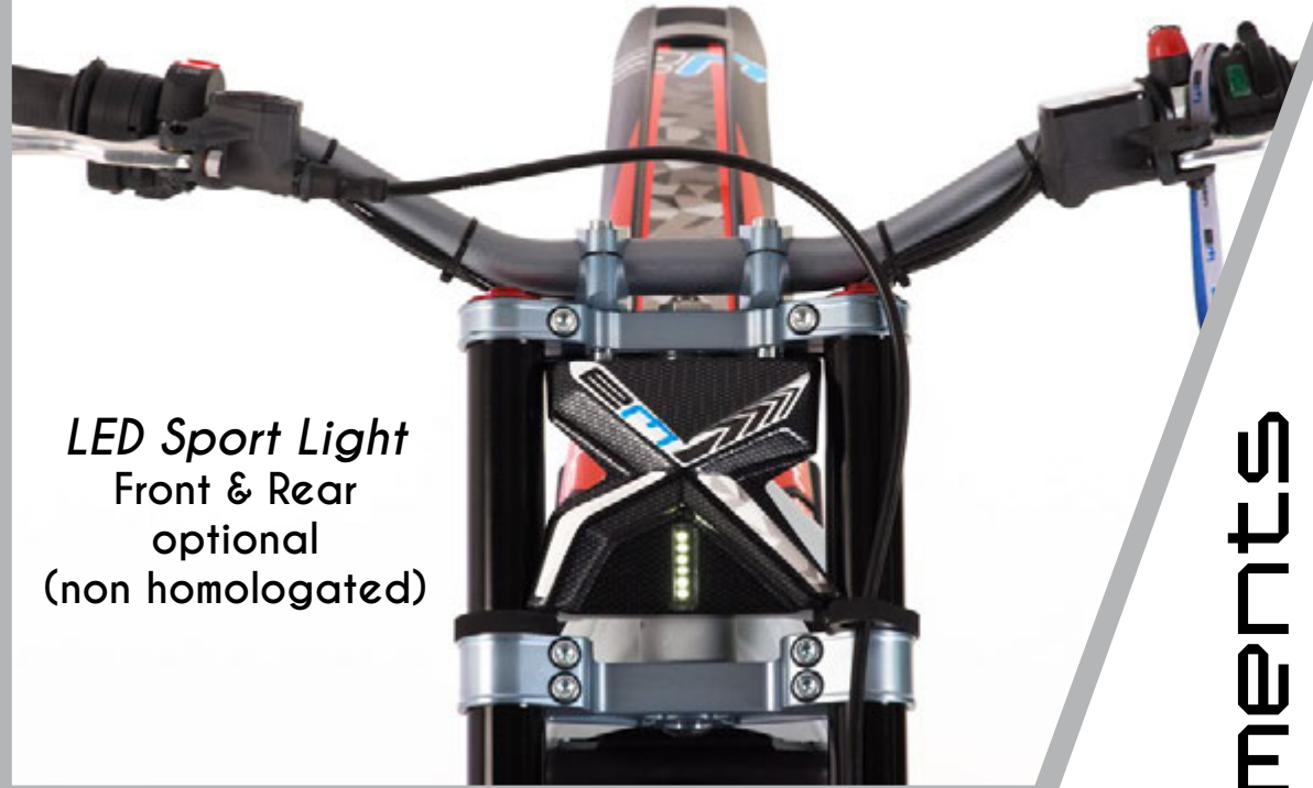
LED Sport Light Front & Rear optional (non homologated)