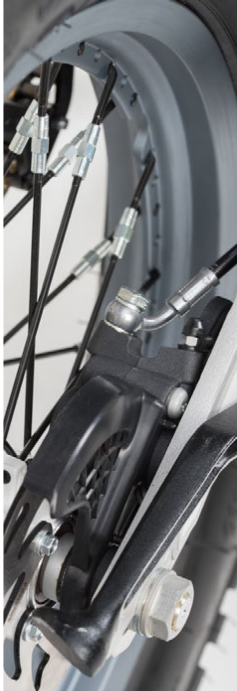
Anodized Rims Matt Grey