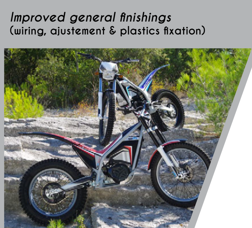
Improved general finishings (wiring, ajustement & plastics fixation)