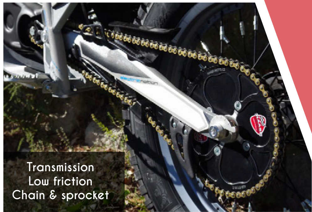
Transmission Low friction Chain & sprocket