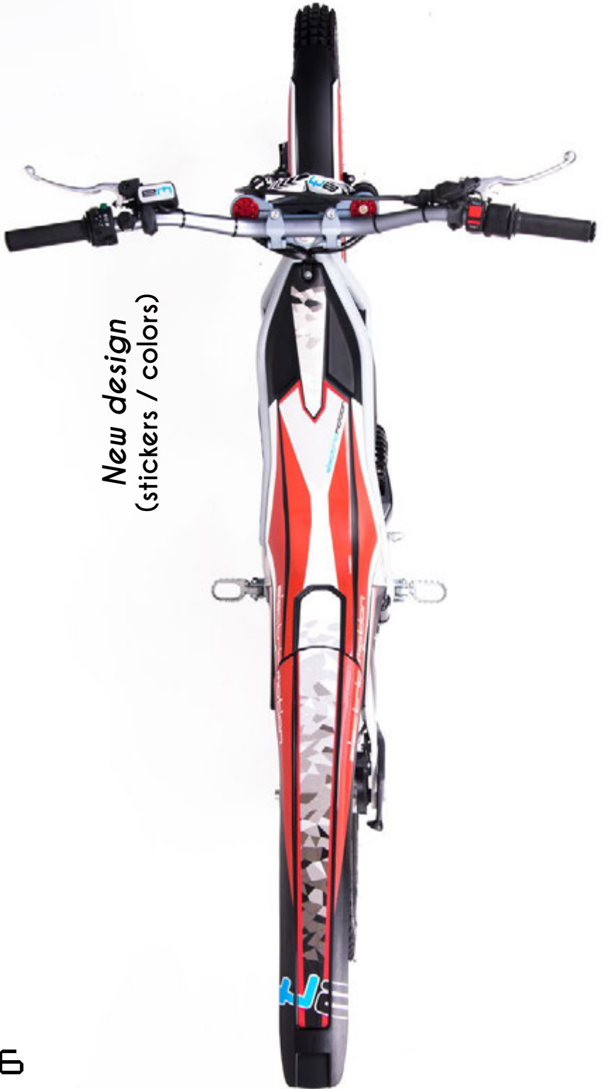
New design (stickers / colors)